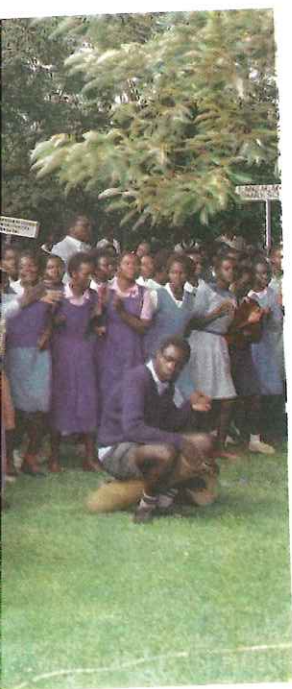
ol choir in singing