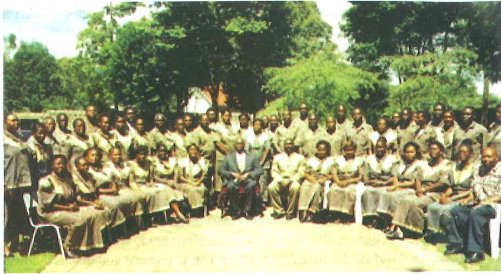
H.E. President Daniel T. Arap Moi Poses with Public Universities Lecturer's choir at His Kabarak Home, October 2002