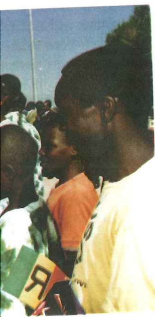
perience with a student